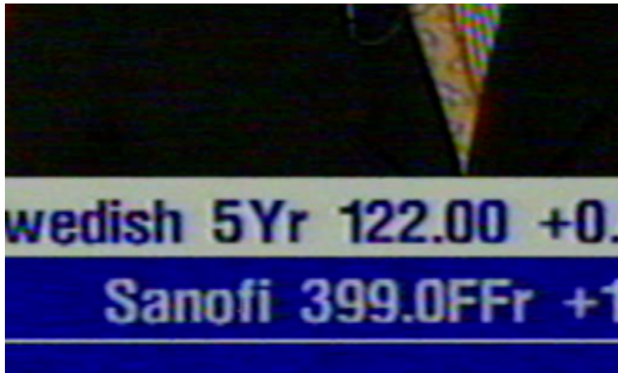
Frame 2 the text is scrolling to the left